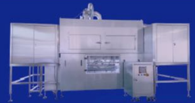
• Can be supplied with optional Bottle Lifter