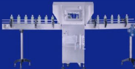
• With optional i-ECO Steam Tunnel