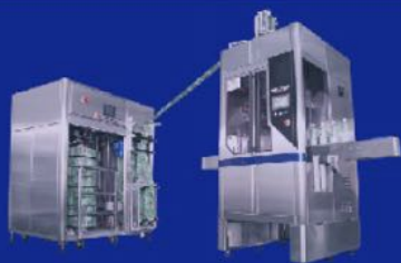
• With optional UWI-8 Multi Label Unwinder