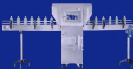
• With optional i-ECO Steam Tunnel