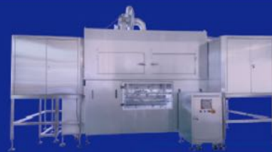
• Can be supplied with optional Bottle Lifter