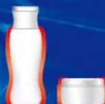
Underlap Labelling Type