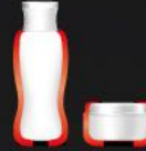
Underlap Labeling Type